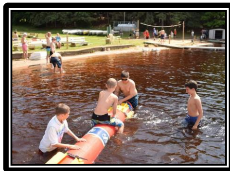
Another busy day at the Waterfront.