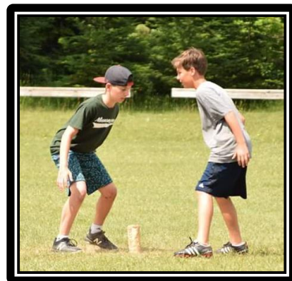
Creatively Acquire stalemate