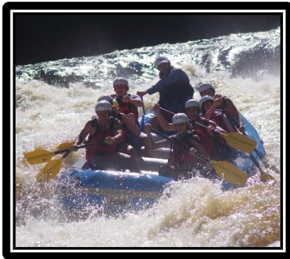
Riding the level four rapids

on arrival were split into two rafts. Raft one was