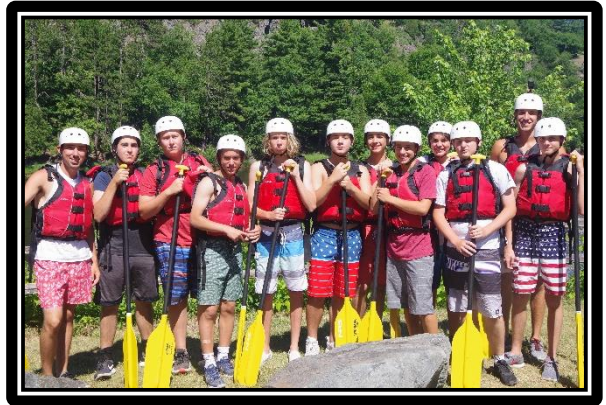
The Senior Cabin ready for their rafting trip

The 2018 senior cabin whitewater rafting trip was an incredible success. The senior cabin members left the friendly confines on Thursday morning after a healthy breakfast and first embarked on a trip down the Peshtigo River. This trip included 6 rapids ranging from level one to level four rapids. During this voyage, the seniors were all in single person rafts and dared each other to test their skills on the level four rapids. That night everyone enjoyed hamburgers and watermelon, thanks to grillmasters MARC GOODMAN and ADAM BALTZ . On Friday morning, the senior cabin departed for the Menominee River rafting trip and