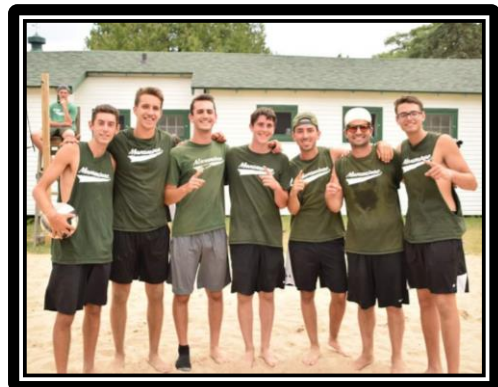
Menominee Volleyball is best in WI