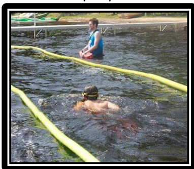
Swimming to first place

Attitude Determination Heart Leadership Spirit Sportsmanship