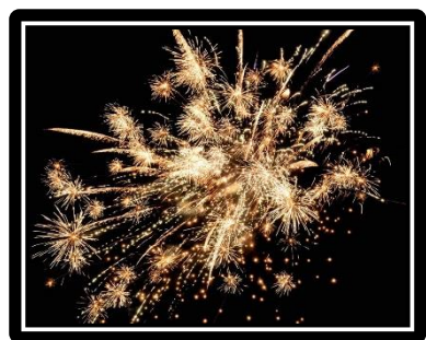
Fireworks at Marimeta